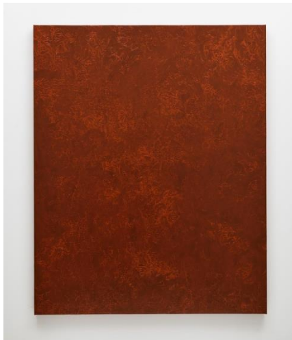
MARS, 2022, Oil, pigment on canvas 162 x 130 cm, 31.9 x 25.8 in.

Gana Art is pleased to present MARS , a solo exhibition of Yoriko Takabatake(b.1982-) who maximizes the physical properties of materials by using natural elements such as water, wind, and fire for her works. This exhibition has been held after her first exhibition Venus opened in South Korea 3 years ago, and Yoriko has constantly experimented with the physical change of paints on canvas by primitive power as before she did. In the early stages of her work, Yoriko focused on the 'physicality' of an artist revealed through the work rather than representation, identifying the canvas as the human body. The labor-intensive characteristics feature the overall Yoriko's works, but on the other hand, she has not been interested in the intended artificial act or the visual illusion. The artist has stuck to a belief, the role of the 'observer', by leaving the change of the physical properties that appear accidentally while adding the physical force of nature. The new series MARS which is exhibited in this exhibition is a new result of an experiment using the iron sand and the magnet. Thus, this exhibition will be an interesting show to appreciate the harmony of the bipolarity of intervention and contemplation as well as the proper mixing of Japanese Mono-ha and Korean monochromatic painting art tendencies that the artist steadily tries.