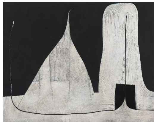
<Untitled Painting 027>, 2016 Acrylic and charcoal, 121.9 x 152.4 cm, 48 x 60 in.