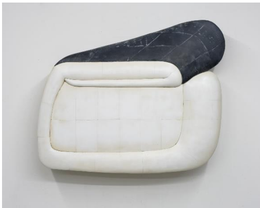
<#90>, 2020 Painted resin, 106.7 x 127 x 24.1 cm, 42 x 50 x 9.5 in.