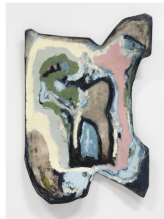
Ernesto Burgos, Untitled, 2022, Resin, fiberglass, wood, charcoal, spray paint, oil paint, 119.4 x 83.8 x 12.7 cm