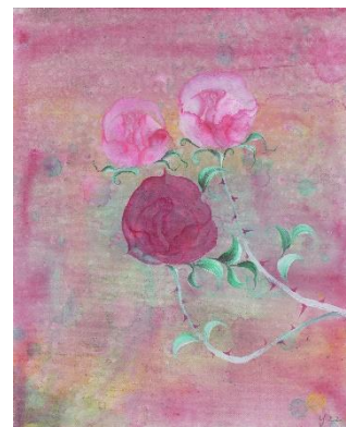
Oh Rose! 22-3-47, 2022 Acrylic on canvas, 27.3 x 22 cm, 10.7 x 8.6 in.