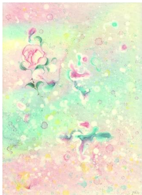
Oh Rose! 22-4-17, 2022 Acrylic on canvas, 33.4 x 24.2 cm, 13.1 x 9.5 in.

Gana Art is pleased to present 《Une Rose》, a solo exhibition featuring the work of Yeesookyung (b.1963-). Yeesookyung first made her mark on the world stage with her "Translated Vase" series, an ingenious way of reassembling discarded ceramic fragments by connecting them with gold leaf, and has since become a leading figure in Korean contemporary art. Yeesookyung's artistic range is expansive, encompassing painting, sculpture, installation, video, drawing, and performance, and she continues experimenting with her work by incorporating disparate elements borrowed from multi-religious and multi-cultural sources into her artworks. In recognition of these attempts, she participated as an invited artist in the 57th VENICE BIENNALE exhibition in 2017 and has held solo exhibitions at world-renowned museums such as Museo e Real Bosco di Capodimonte in Italy, Asia Society Texas Center in the United States, Atelier Hermès in Korea, Museum of Contemporary Art Taipei in Taiwan, and Museum Schloß Oranienbaum in Germany. Yeesookyung's work has been acquired by esteemed collections such as the Los Angeles County Museum of Art, The British Museum, M+ Museum in Hong Kong, ARCO Collection in Spain, and the National Museum of Contemporary Art in Korea. The solo exhibition 《Une Rose》 will feature a new series of paintings titled <Oh, Rose!>, which explores the rose motif that the artist has been investigating recently.